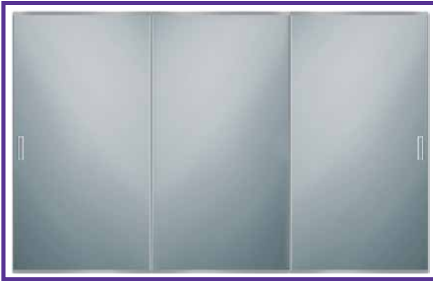
Pictured in a Satin Clear finish with Duraflect ® copper-free mirror insert