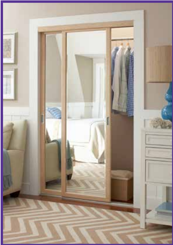
Photo shows a Clear Acrylic Sealer finish with Duralect® copper-free mirror insert