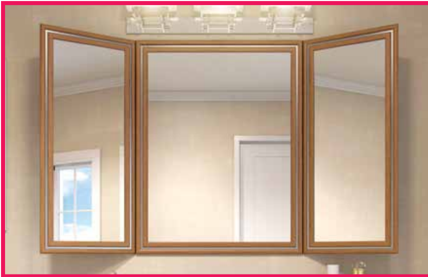
Pictured in a Clear Acrylic Sealer finish and Chrome mylar accent with Duraflect® copper-free mirror