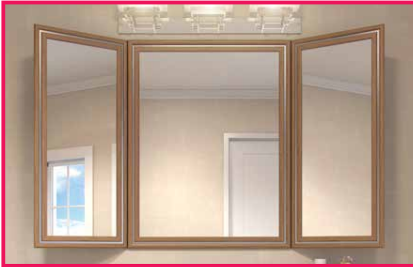
Photo shows a Clear Acrylic Sealer finish and Chrome mylar accent with Duraflect® copper-free mirror insert