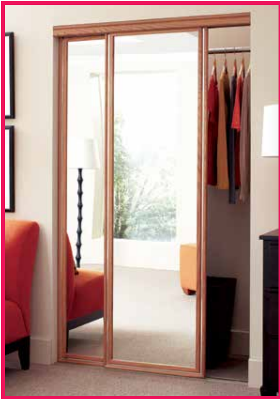
Pictured in a Light Oak Stain finish and Chrome mylar accent with Duraflect® copper-free mirror