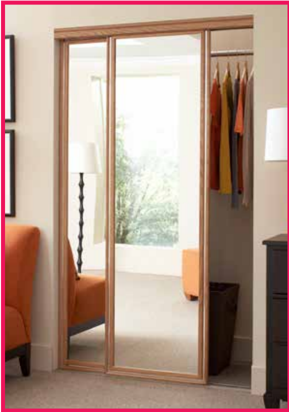
Photo shows a Light Oak Stain finish and Chrome mylar accent with Duraflect® copper-free mirror insert