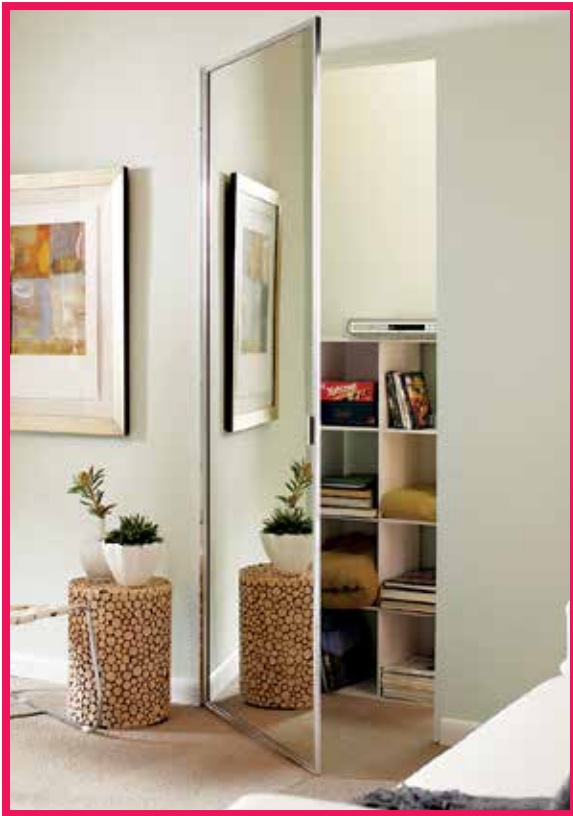
Pictured in a Bright Clear finish with Durafect® copper-free mirror