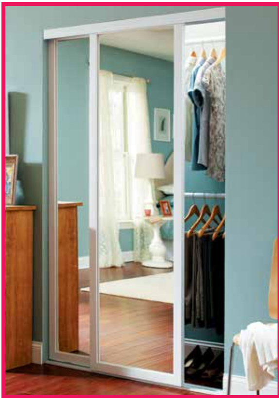
Pictured in a White (Gloss) finish with Duraflect® copper-free mirror