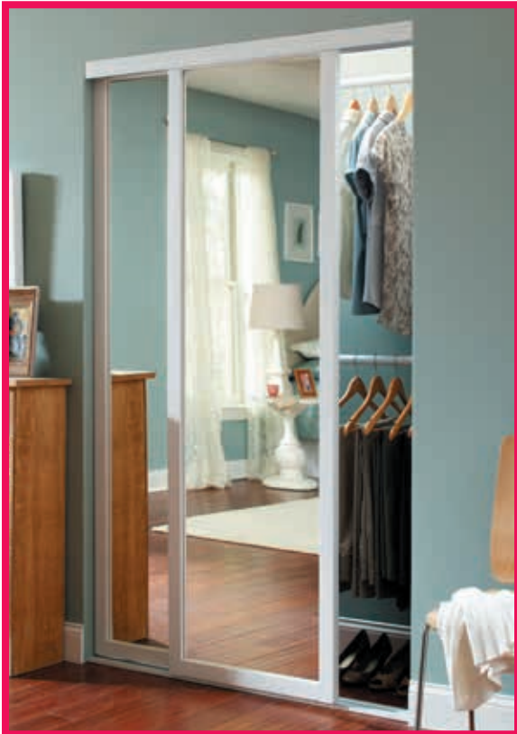
Photo shows a White (Gloss) finish with Duralect® copper-free mirror insert