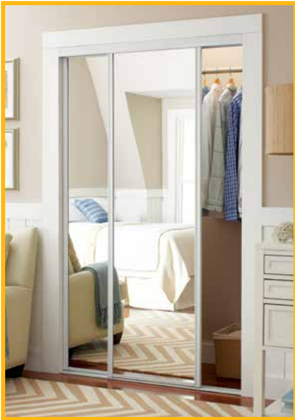
Pictured in a Gloss White finish with Duraflect® copper-free mirror