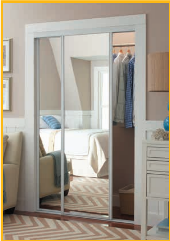
Photo shows a Gloss White finish with Duralect® copper-free mirror insert