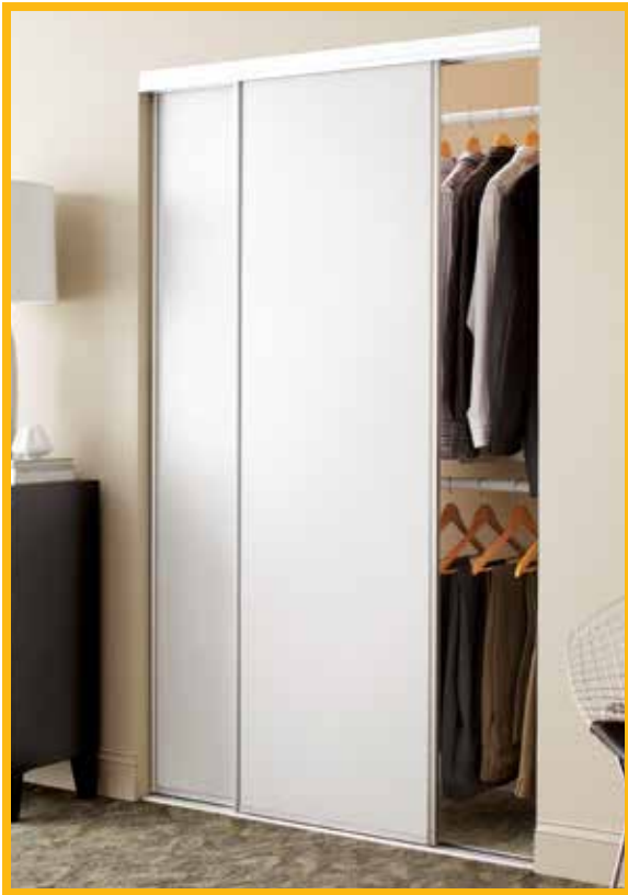
Pictured in a White finish with White hardboard