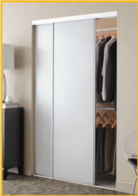
Photo shows a White (High-Gloss) finish with white hardboard insert