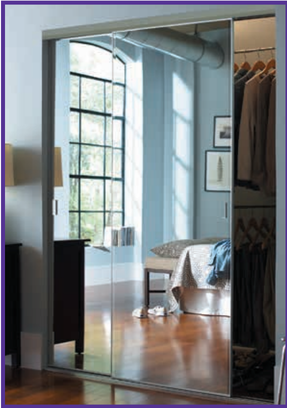
Photo shows a Bright Clear finish with Duralect® copper-free mirror insert