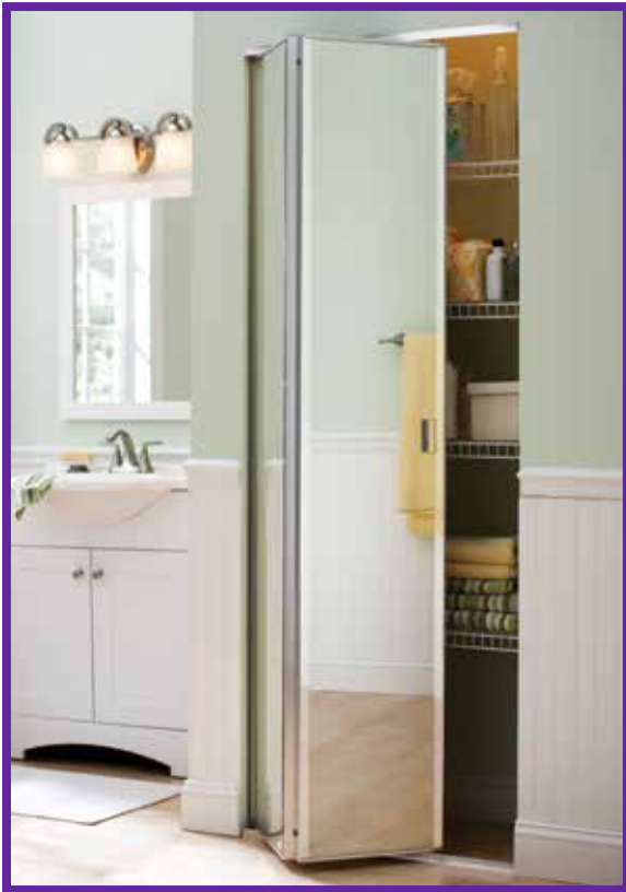
Pictured in a Bright Clear finish with Duraflect ® copper-free mirror