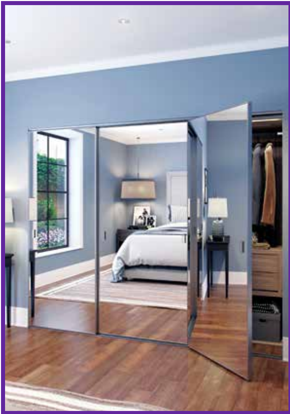
Pictured in a Bright Clear finish with Duraflect ® copper-free mirror