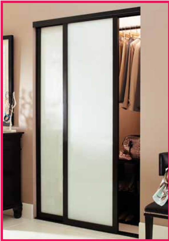
Pictured in an Espresso finish with Snow White back painted glass