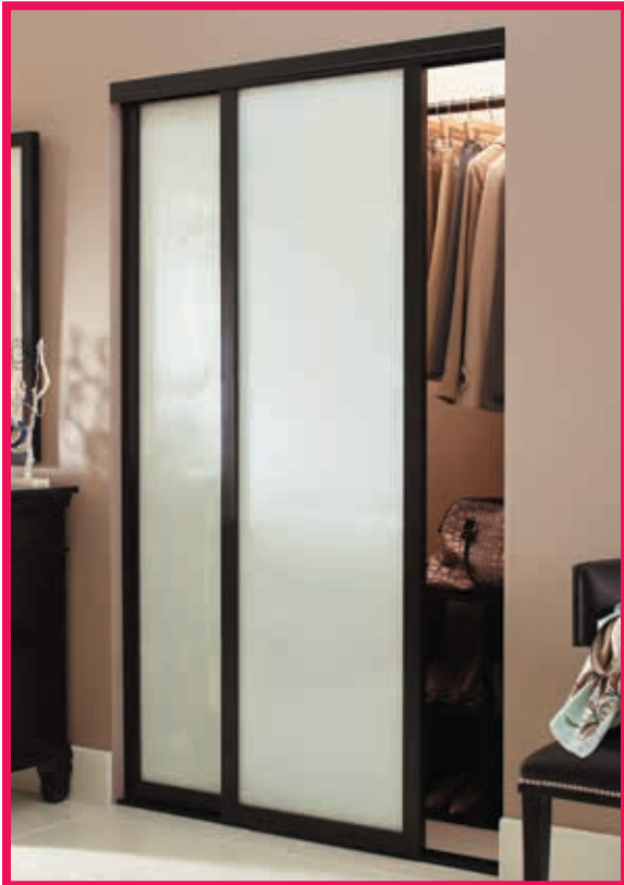
Photo shows a Espresso finish with Snow White back painted glass insert