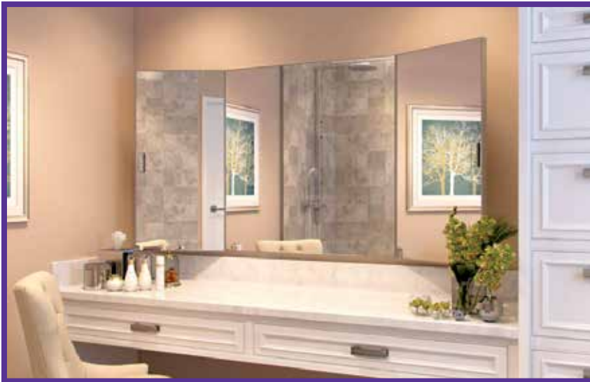
Pictured in a Brushed Nickel finish with Durafect ® copper-free mirror