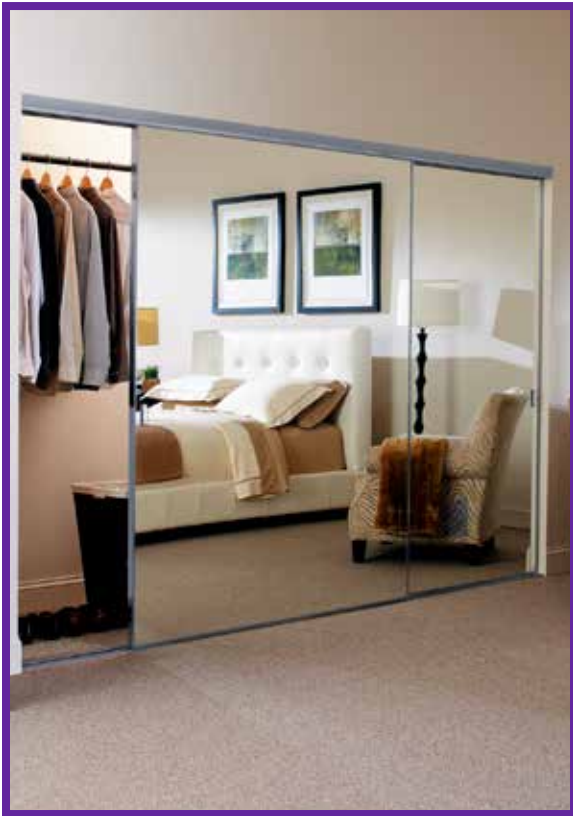
Pictured in a Satin Clear finish with Duraflect ® copper-free mirror