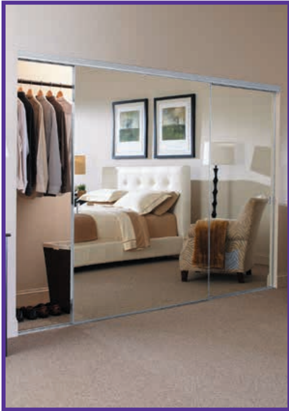
Photo shows a Satin Clear finish with Duraflect® copper-free mirror insert