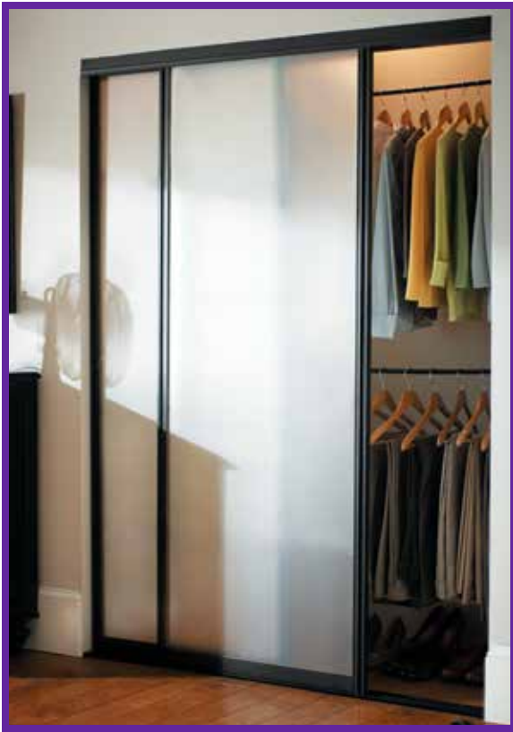
Pictured in a Bronze finish with Mystique™ Duratuf® tempered safety glass