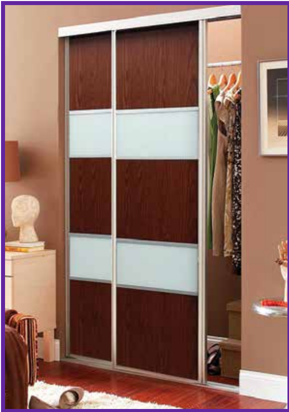
Pictured as a 5 lite 3/2 in a Satin Clear finish with Walnut wood grain inserts and Snow White back painted glass