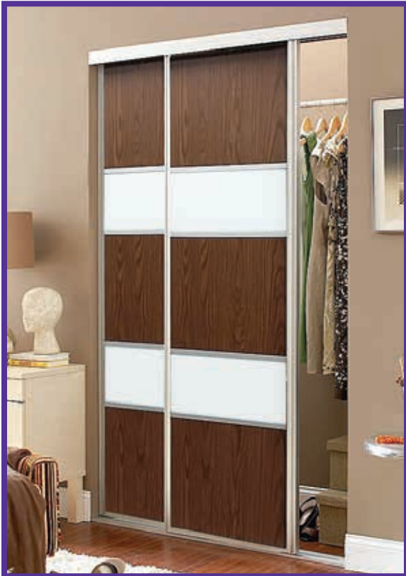
Photo shows a Bright Clear finish in 5 lite 3/2 with Walnut wood grain Snow White back painted glass inserts