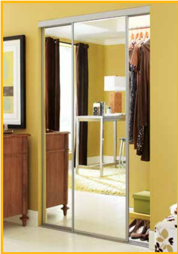
Pictured in a Silver Nickel finish with Duraflect® copper-free mirror