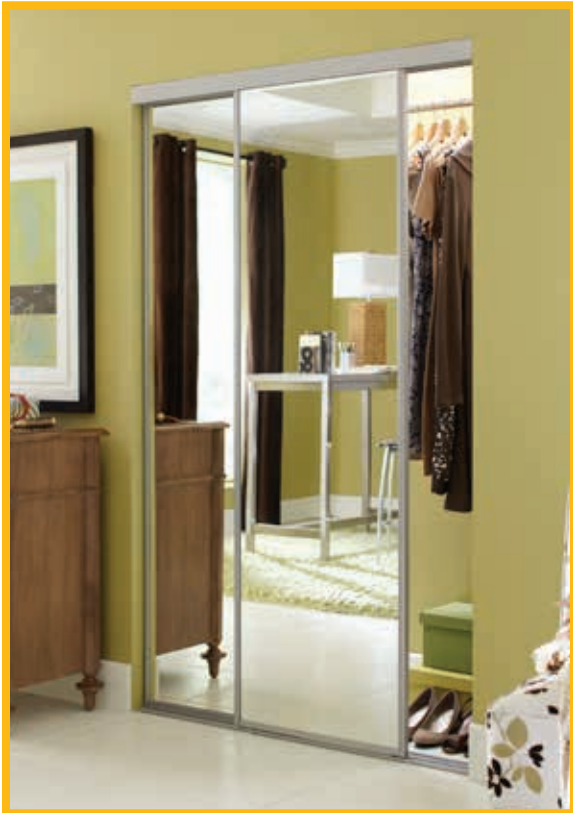
Photo shows a Silver Nickel finish with Duralect® copper-free mirror insert