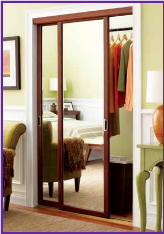
Pictured in a Dark Stain finish with Duraflect® copper-free mirror