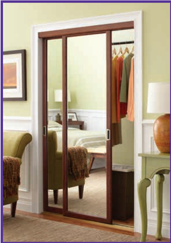
Photo shows a Dark Stain finish with Duraflect® copper-free mirror insert