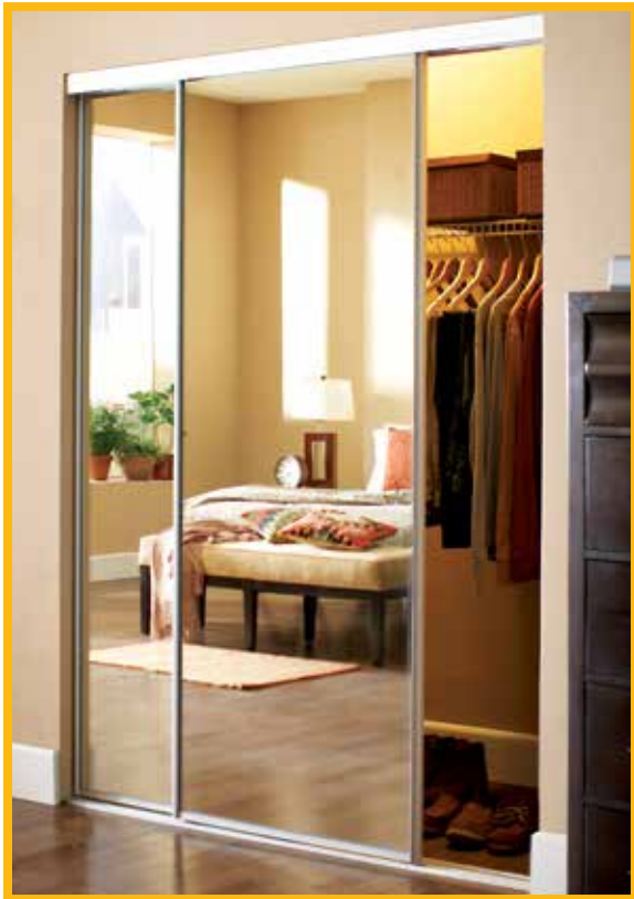
Pictured in a Satin Clear finish with Duraflect® copper-free mirror