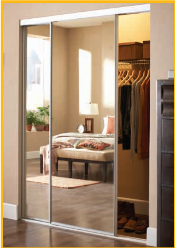
Photo shows a Bright Clear finish with Durafect® copper-free mirror insert