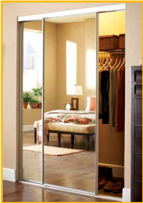
Pictured in a Satin Clear finish with Duraflect® copper-free mirror