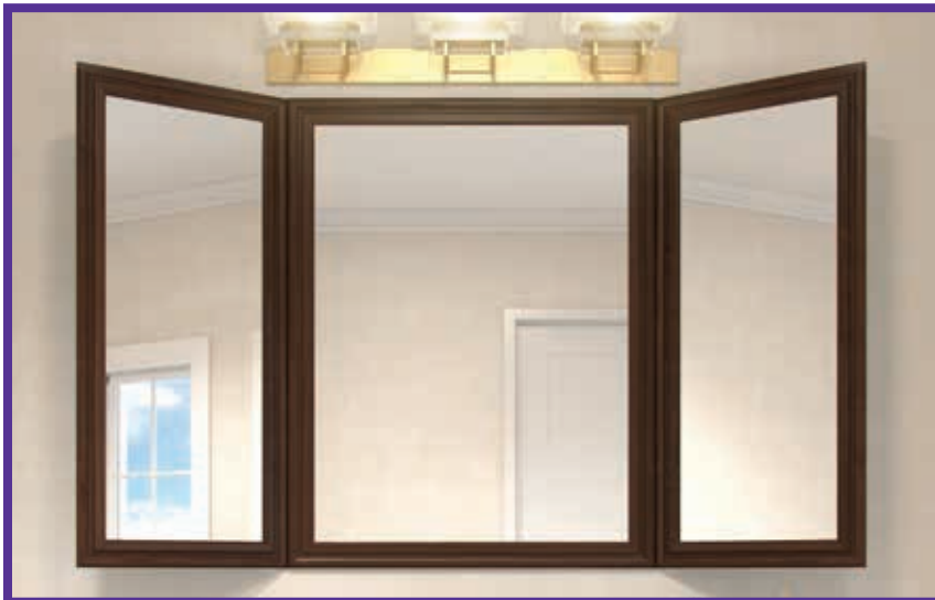
Photo shows a Dark Stain finish with Durafect ® copper-free mirror insert