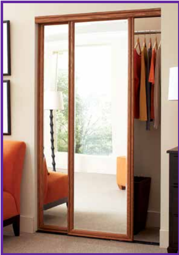
Pictured in a Medium Stain finish with Duraflect® copper-free mirror