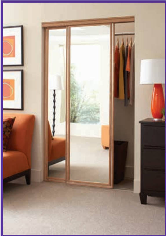
Photo shows a Medium Stain finish with Chrome insert and Duralect® copper-free mirror insert