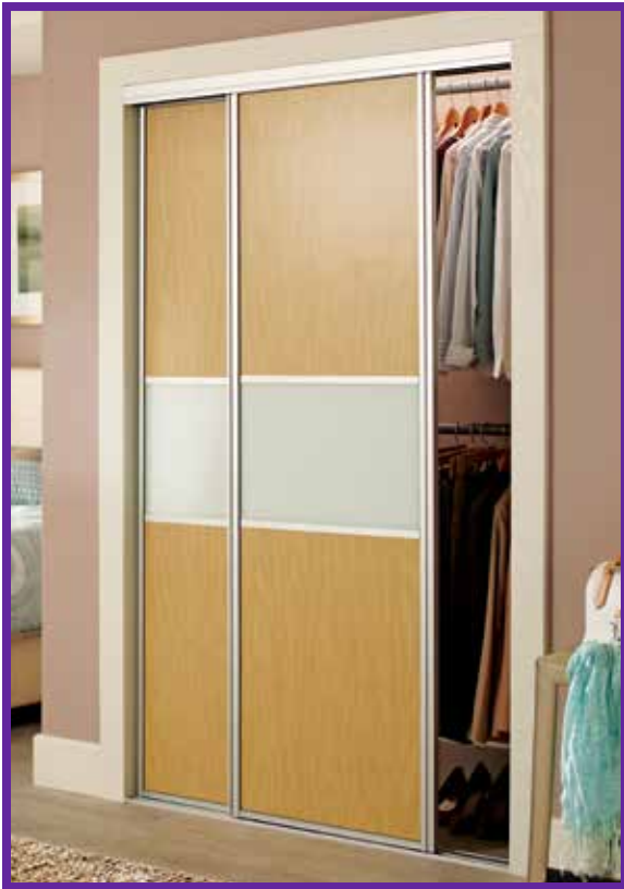
Pictured as a 3 lite middle in a Satin Clear finish with Maple wood grain inserts and Snow White back painted glass