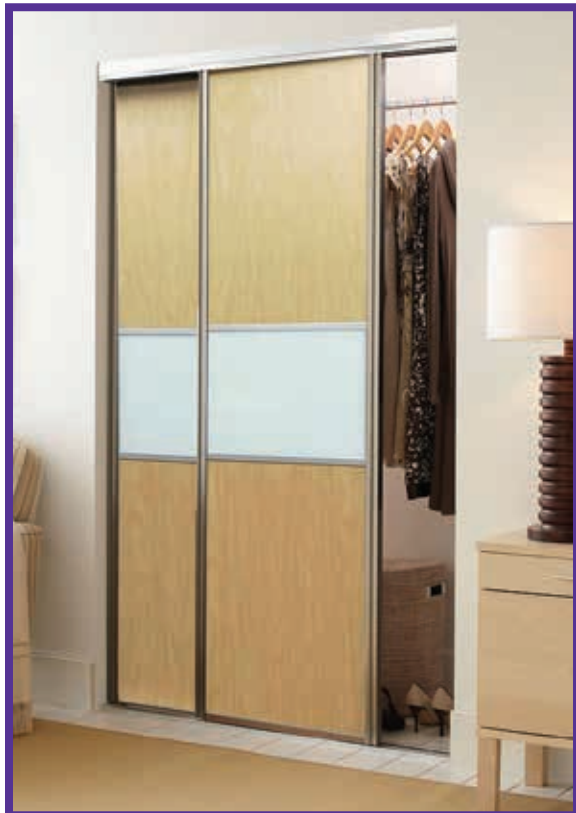
Photo shows a Satin Clear finish in 3 lite middle with Maple wood grain and Snow White back painted glass inserts