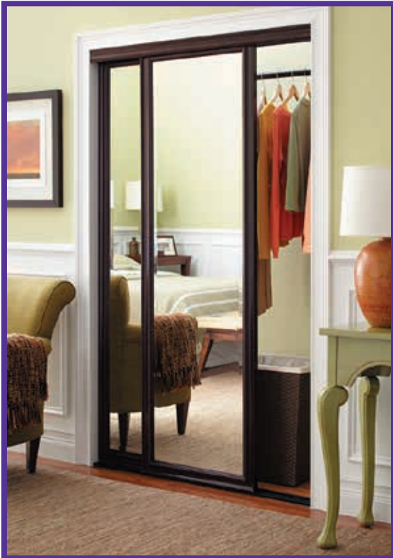
Photo shows a Dark Cherry finish with Durafect® copper-free mirror insert