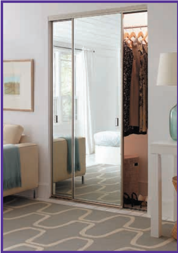
Photo shows a Brushed Nickel finish with Durafect® copper-free mirror insert