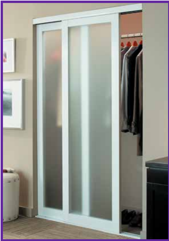
Pictured in a White finish with Mystique™ Duratuf® tempered safety glass