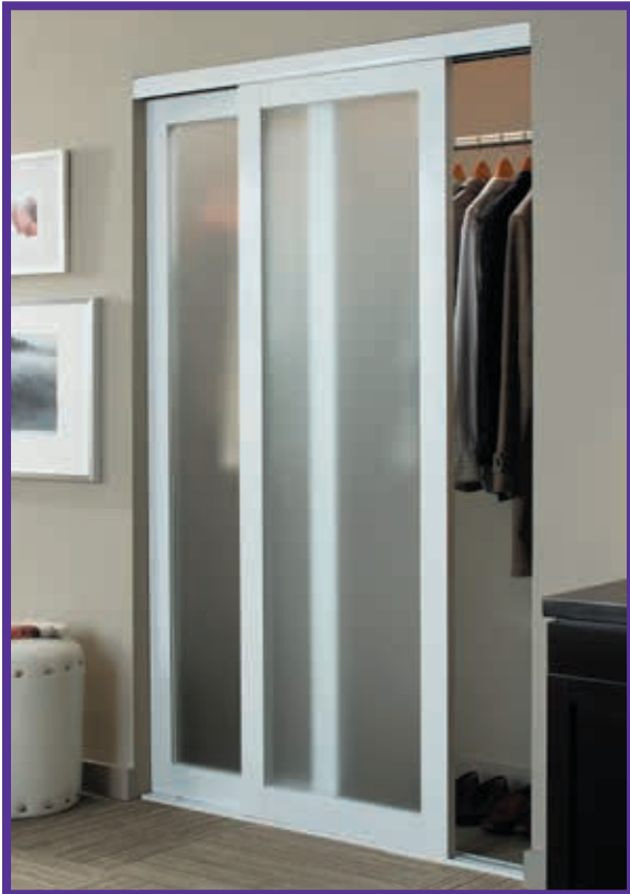
Photo Shows a White (High-Gloss) finish with Mystique™ Duratuf® tempered safety glass