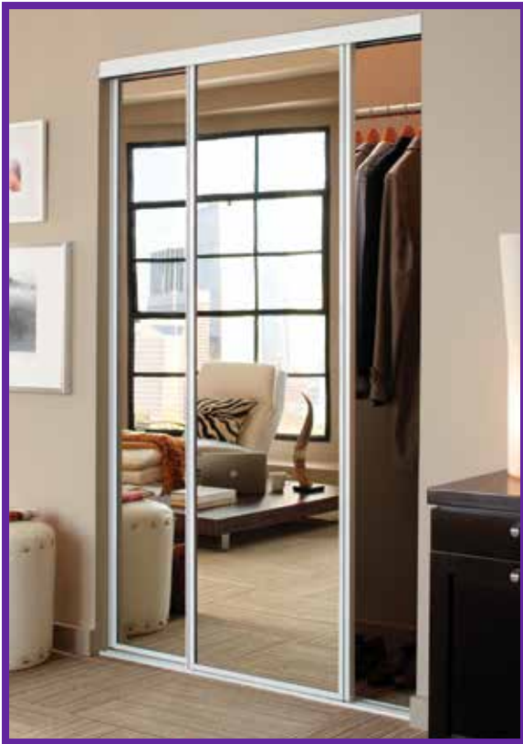
Pictured in a White finish with Duralect® copper-free mirror