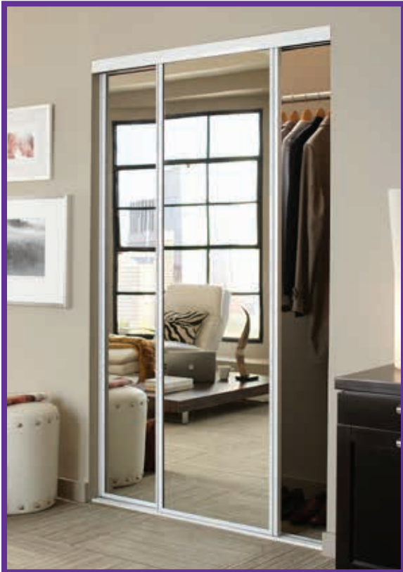
Photo shows a Bright Clear finish with Durafect® copper-free mirror insert