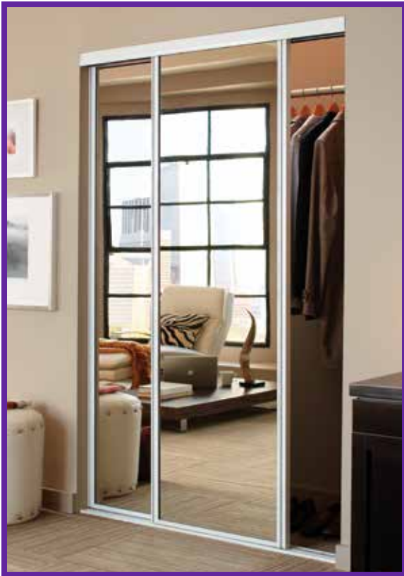
Pictured in a White finish with Duraflect® copper-free mirror