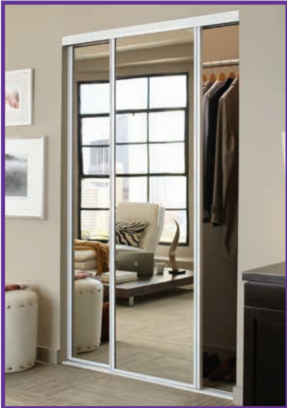
Photo shows a Bright Clear finish with Durafect® copper-free mirror insert