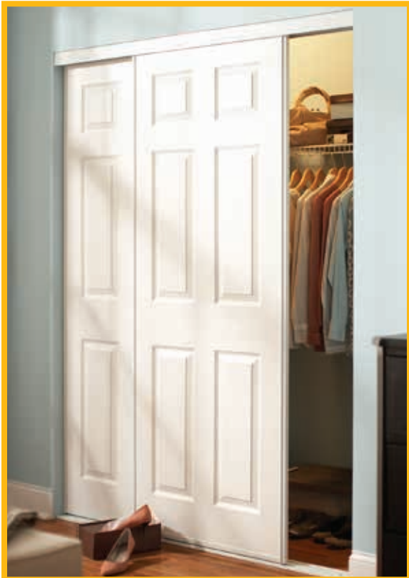
Photo shows a Gloss White finish with a raised 6 panel white hardboard insert