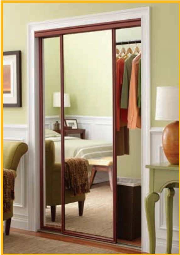
Photo shows a Red Mahogany Stain finish with Duraflect® copper-free mirror insert