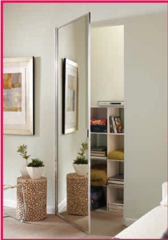
Photo shows a Bright Clear finish with Durafect® copper-free mirror insert