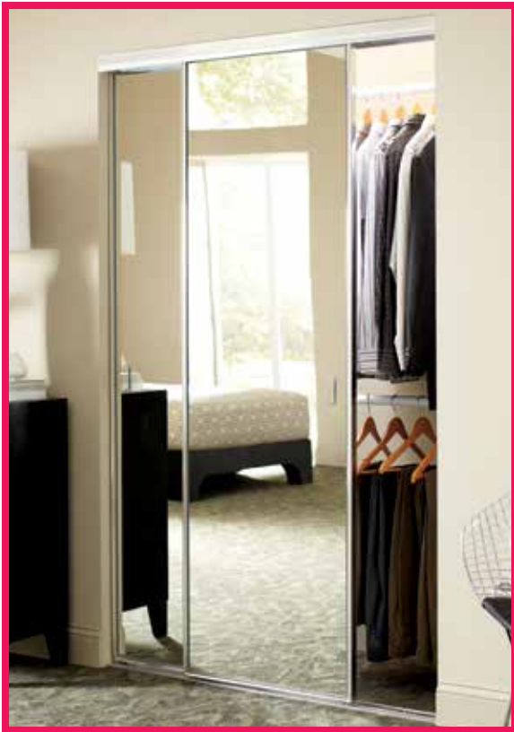
Pictured in a Bright Clear finish with Duraflect® copper-free mirror