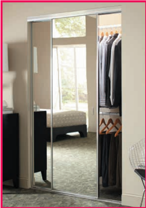
Photo shows a Bright Clear finish with Durafect® copper-free mirror insert