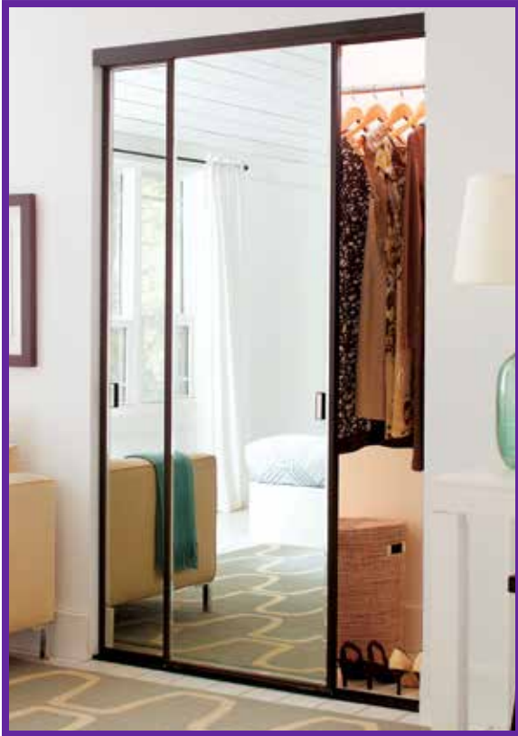
Pictured in a Bronze finish with Duralect® copper-free mirror